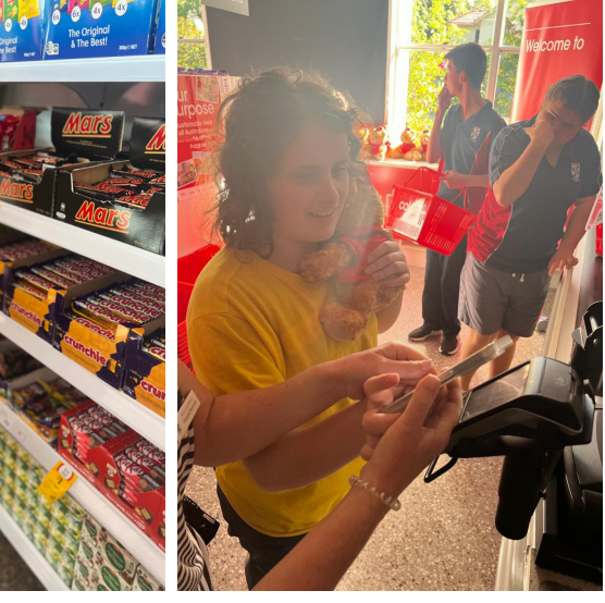
EAGLE CLASS SHOPPING IN COLES