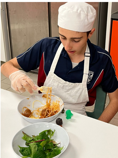
EAGLE CLASS FOOD TECH