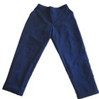
Long Sleeve Pants