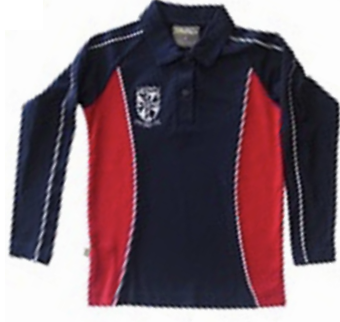
Long Sleeve Polos