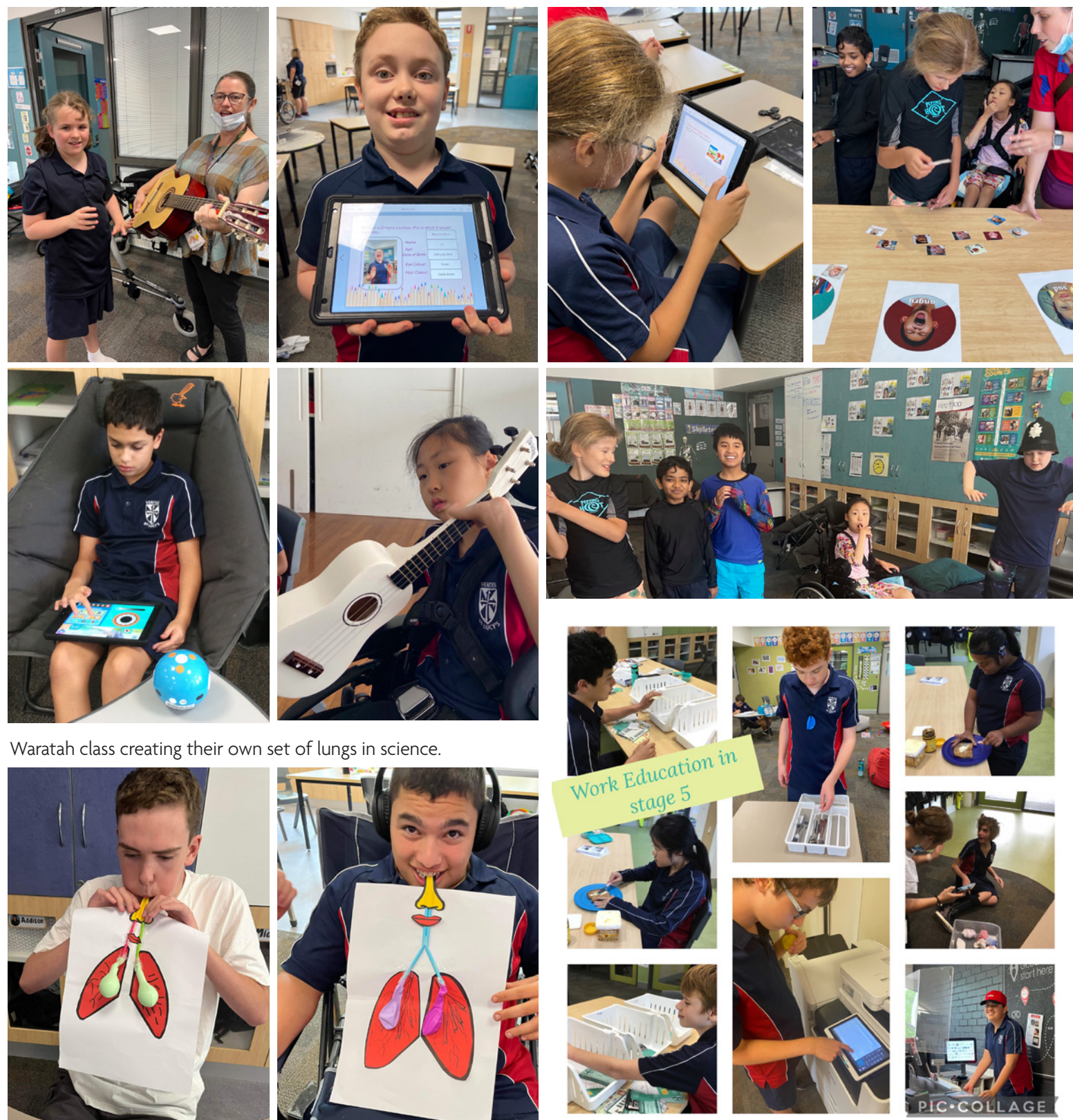
Waratah class creating their own set of lungs in science.